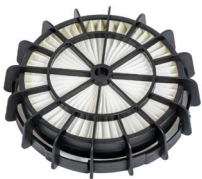
HEPA 13 FILTER