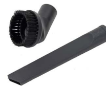
CREVIC TOOL & DUSTING BRUSH