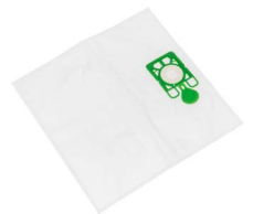
MICROFIBRE DUST BAGS