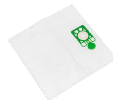
MICROFIBRE DUST BAGS