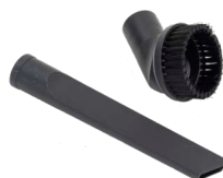
CREVIC TOOL & DUSTING BRUSH